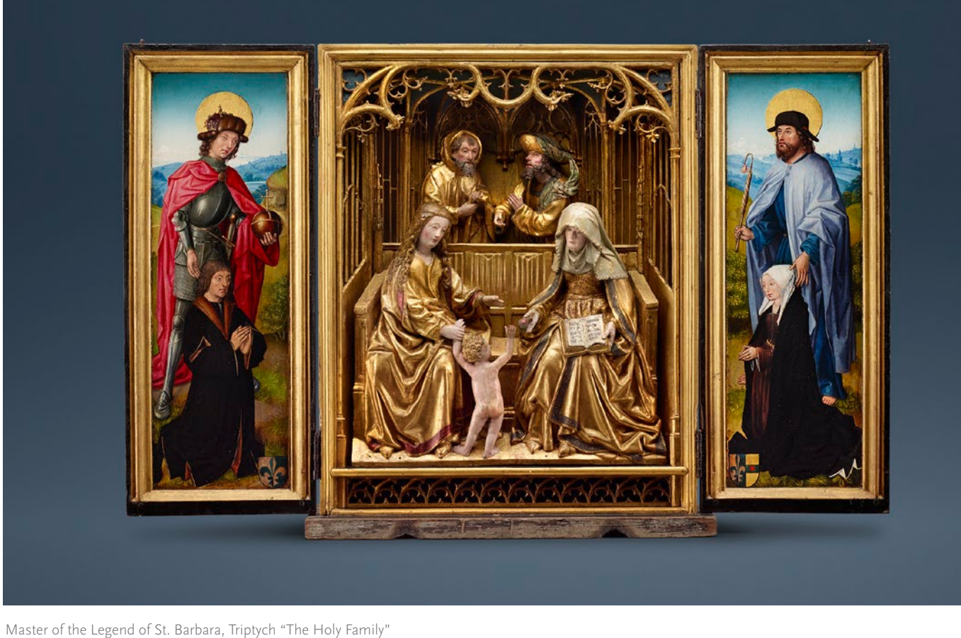
Brussels, circa 1500 Sold to the Montreal Museum of Fine Arts in 2015.

in the special field of Late Gothic sculpture.