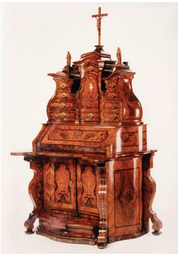
Unique Writing Cabinet with Prayer Desk Franconia, circa 1755 Sold to the Bayerisches National Museum in 2008.